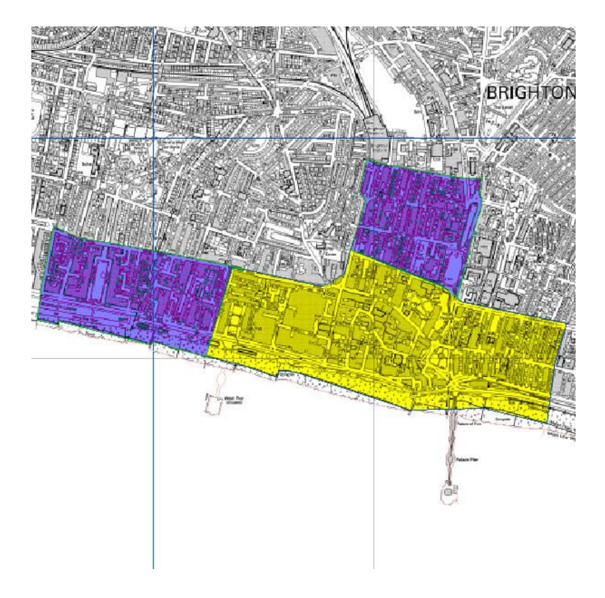
Area 1 - an area bounded by and including: the north side of Western Road, Brighton from its intersection with the west side of Spring Street and along the north side of Western Road, Hove to its intersection with the west side of Holland Road; southward along the west side Holland Road to its end and then due south across the Kingsway to the mean water mark; along the mean water mark eastwards to the intersection with the boundary of the cumulative impact area and along that boundary northwards to the intersection of Western Road, Brighton with the west side of Spring Street.

The areas recommended for further monitoring and detailed guidance within the Special Policy comprise the following as pictured below:-